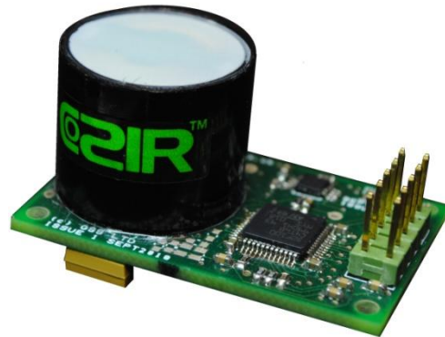
COZIR™ Wide Range Sensor