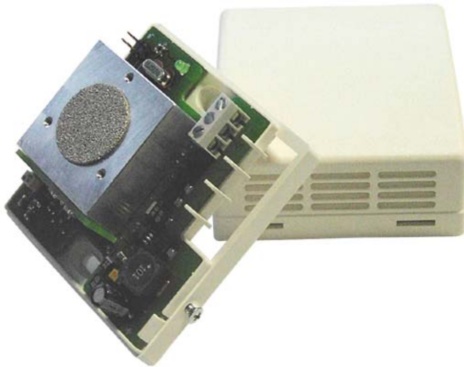
Fig. 1: Gas measuring system AQ-Transmit.

The two-beam infrared sensor is mounted in a plastic housing on a sensor holder above the diffusion opening. In addition, a transmitter containing a signal amplifier and an output of 4-20 mA or 0-10 V is arranged in the housing. The transmitter based on the three-wire system processes and transmits the measured signals (see Fig. 1).